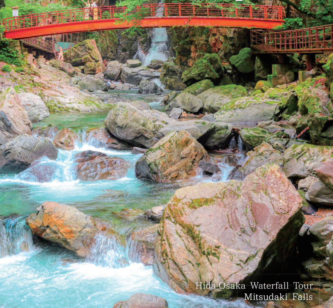
Hida-Osaka Waterfall Tour Mitsudaki Falls