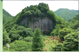
Gandate, the cliff of lava.

~The city of waterfalls and the carbonated hot spring~