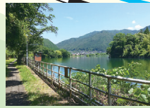
View towards the city from the dam